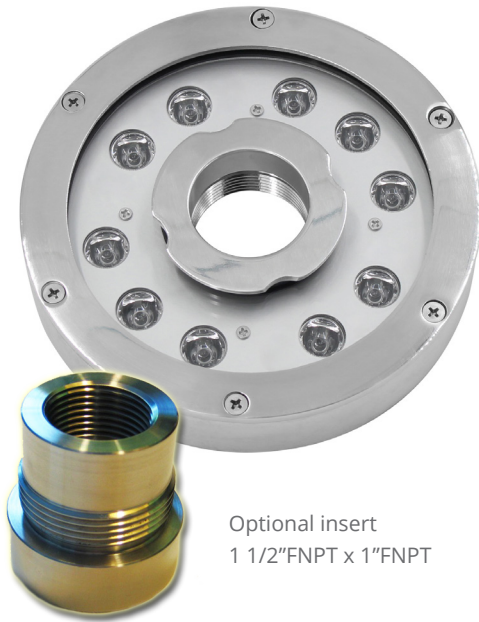
Optional insert 1 1/2"FNPT x 1"FNPT

Cast 316L Stainless Steel - Replaceable LEDs Submersible or Dry Installation SS Flush Mount Mirror Polish Face Ring - center opening 1.85" Optional SS threaded adapter to fit 1" nozzle, 1 1/2" pipe