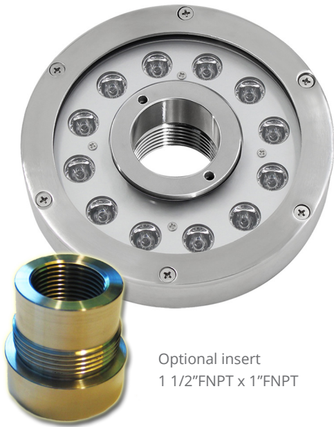
Optional insert 1 1/2"FNPT x 1"FNPT

Cast 316L Stainless Steel - Replaceable LEDs Submersible or Dry Installation SS Flush Mount Mirror Polish Face Ring Optional threaded center adapter to fit 1" nozzle, 1 1/2" pipe