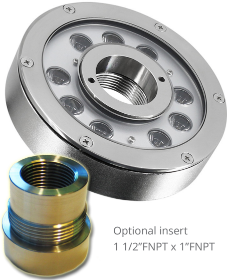
Optional insert 1 1/2" FNPT x 1" FNPT

27W (9 X 3W) - RGB-DMX - 12AC/24DC SUBMERSIBLE OR DRY CAST 316L SS REPLACEABLE LEDS UL CERTIFIED FOR SWIMMING POOLS