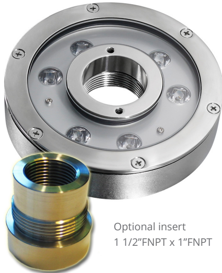
Optional insert 1 1/2" FNPT x 1" FNPT

24W (6 X 4W) - RGBW-DMX - 12AC/24DC SUBMERSIBLE OR DRY CAST 316L SS REPLACEABLE LEDS UL CERTIFIED FOR SWIMMING POOLS