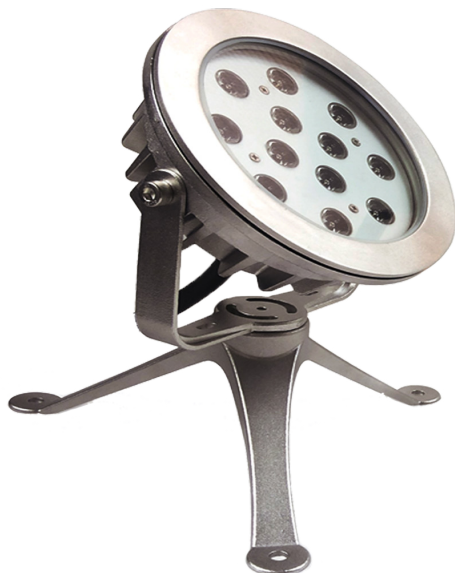
UL316-36 (12 X 3W) shown

Cast 316L Stainless Steel - Replaceable LEDs Removable Yoke, optional tripod, custom extension post Submersible or Dry Installation Flush Mount Face Ring SS Niche optional